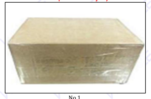
Domestic express packaging: Wrapped by Transparent tape

Minors are prohibited from using transparent tape, yellow tape, black wrapping protective film, and white wrapping protective film to avoid personal injury.