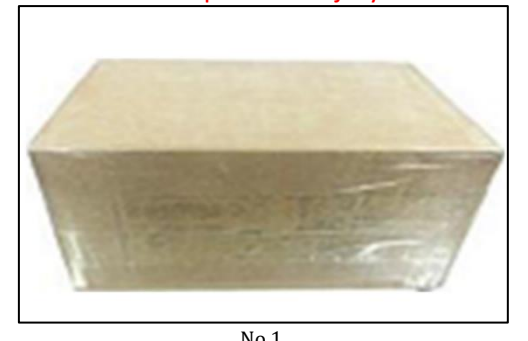
Domestic express packaging: Wrapped by Transparent tape

Minors are prohibited from using transparent tape, yellow tape, black wrapping protective film, and white wrapping protective film to avoid personal injury.