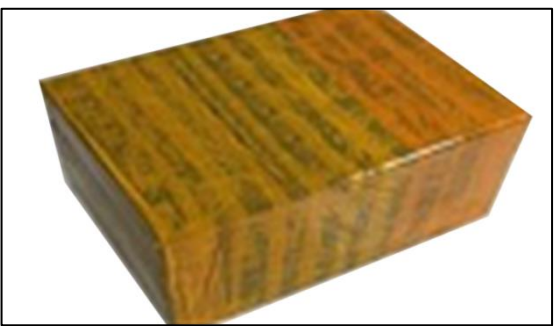
Pic No.2 International express packaging: Wrapped with yellow tape after wrapping black protective film

Domestic express packaging: Wrapped by Transparent tape